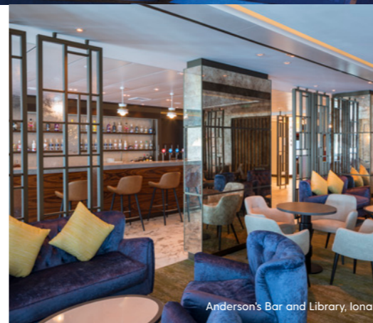
Anderson's Bar and Library, Iona