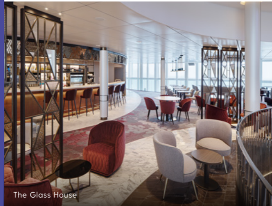
The Glass House

Whatever you fancy – it's on Iona's menu. Authentic flavours of your destination? Try out regional specialities by our Local Food Heroes, including José Pizarro in The Glass House and Kjartan Skjelde in Epicurean. Beautifully crafted gastropub fare? Welcome to The Keel & Cow, home to a fine selection of tipples and where you can meet (and eat) The Prime Minister (arguably the best burger at sea!). From relaxed and informal to chic and special, there's a world of drinks and dining to explore on board.