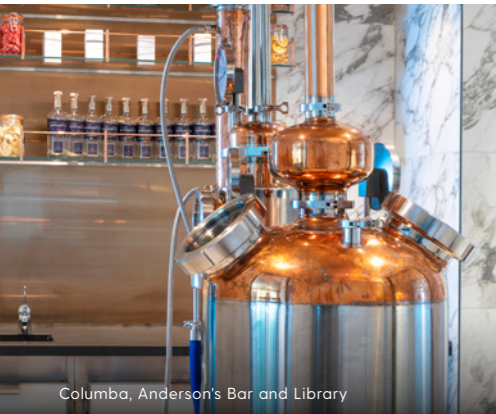
Columba, Anderson's Bar and Library

Catch mesmerising performances in SkyDome, like international entertainment company Creativiva's fantastical aerial shows. Enjoy the best seat in the house at Headliners Theatre with its full-stage LED backdrop. And you won't want to miss a second of Iona's immersive entertainment, such as our brand-new themed contemporary show DIGITAL.