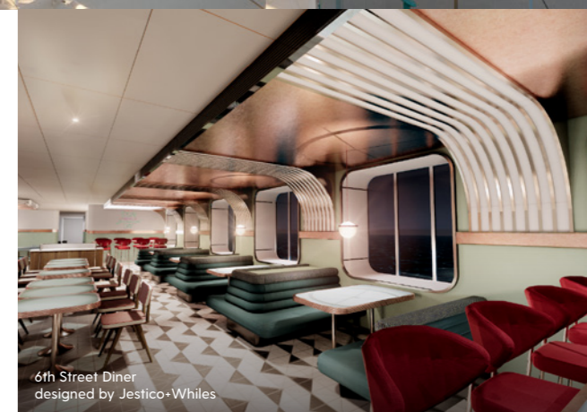
6th Street Diner designed by Jestico-Whites