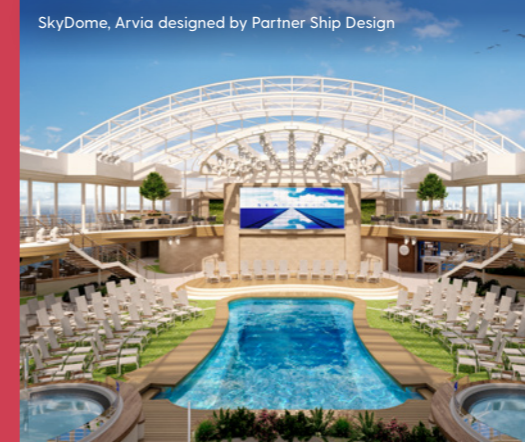
SkyDome, Arvia designed by Partner Ship Design

Your holiday wishes have shaped every aspect of our Excel class ships' design and experience so that you can enjoy a getaway unlike any other. Their signature, sociable spaces are sure to wow.